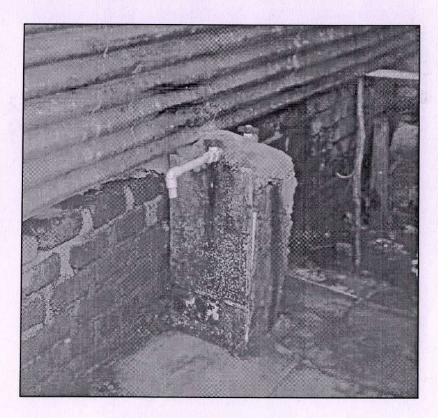
Drinking Water Supply